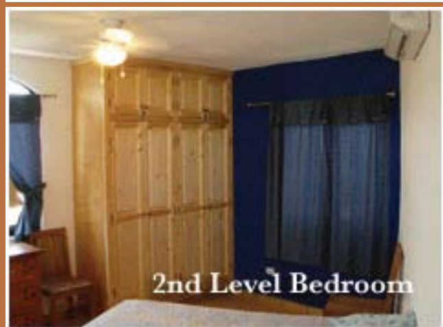
2nd Level Bedroom